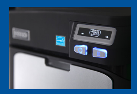
The DTC4000's high resolution graphical SmartScreen™ displays error handling similar to that of a copy machine. Its user-friendly interface steps you through the entire printing process.

The FARGO DTC4000 Direct-to-Card printer is ideal for mid-size organizations seeking versatility in a convenient, professional and secure printing and encoding system. Whether you need employee access cards or membership cards for a gym, the DTC4000 produces brilliant photo ID cards as well as bar codes and digital signatures for more sophisticated access control and identification cards. Its sleek, scaleable design simplifies equipment upgrades and migrations to higher levels of security.